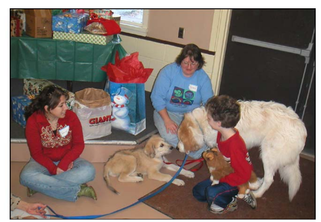
Penn-Dutchies, fuzzy and not so fuzzy, enjoy the Holiday Party in the Lodge at Lancaster Central Park.

The PDGPC newsletter, Pyr-A-Scoop , will be published at least 4 times a year for the members of the Penn-Dutch Great Pyrenees Club as a means of sharing information. Opinions reflected in articles and advertisements are those of the writer(s) and are not necessarily held by the editorial staff, PDGPC members or the Board of Directors. Any material in this publication may be reprinted (unless otherwise noted), as long as credit is given to both the author and source and no changes are made in the copy without permission.