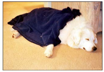
Bonnie dreams of her big adventure at the end of a long day.

Note from Mommy: The Perkiomen Trail is nice in that it goes past areas that have trash cans, poop bags, restrooms and soda machines. The Skorups would love to hike on the trail again in the future. Anyone interested in hiking with us should contact us.