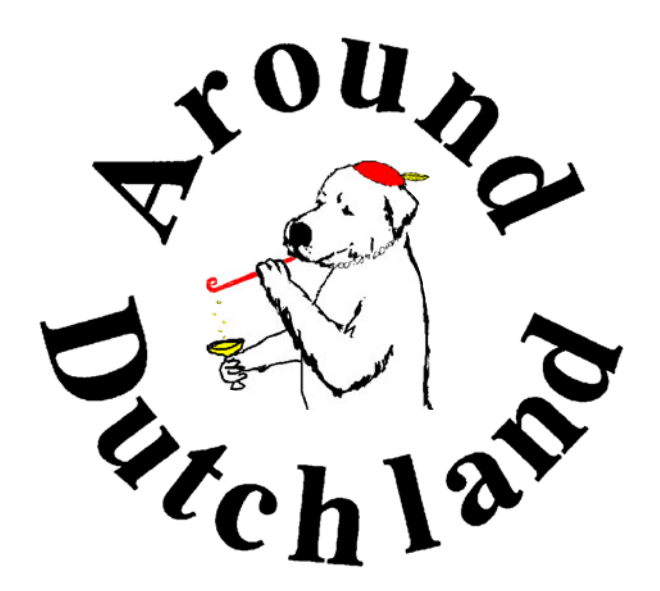
by Penny Pyrbred

Of course this issue should have been out in April, but our editor was under the weather (MDs just aren't as good as vets).