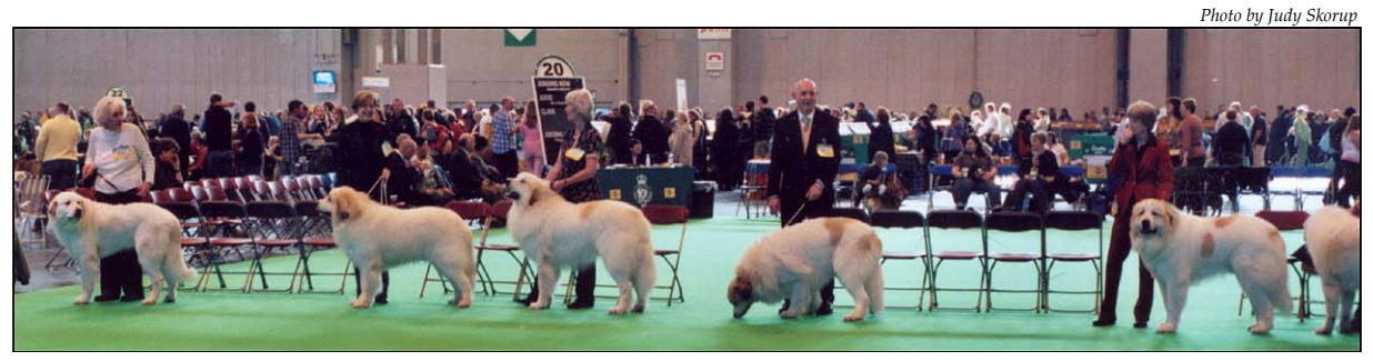
Pyrs prepare to show at Crufts, 2007.