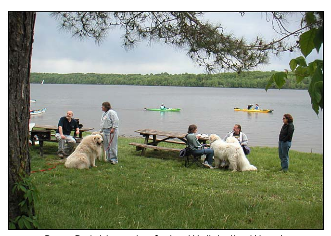
Penn-Dutchies enjoy Spring Walk-in-the-Woods at Lake Nockamixon