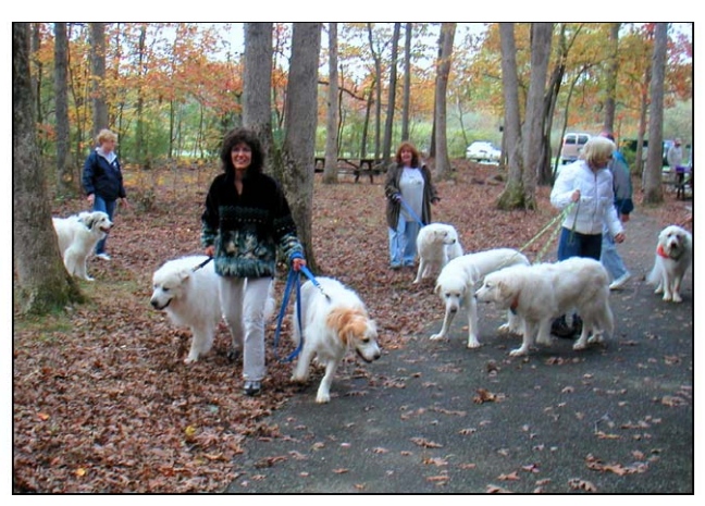
Fall Walk-in-the-Woods attracted a crowd of Pyrs and their people.