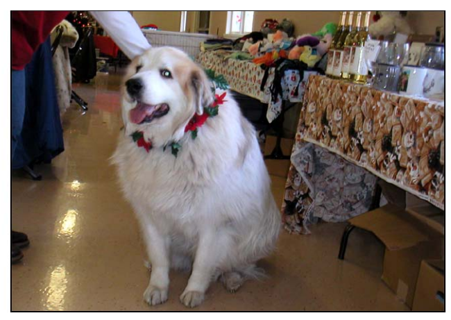
All dressed up for the Holiday Party.