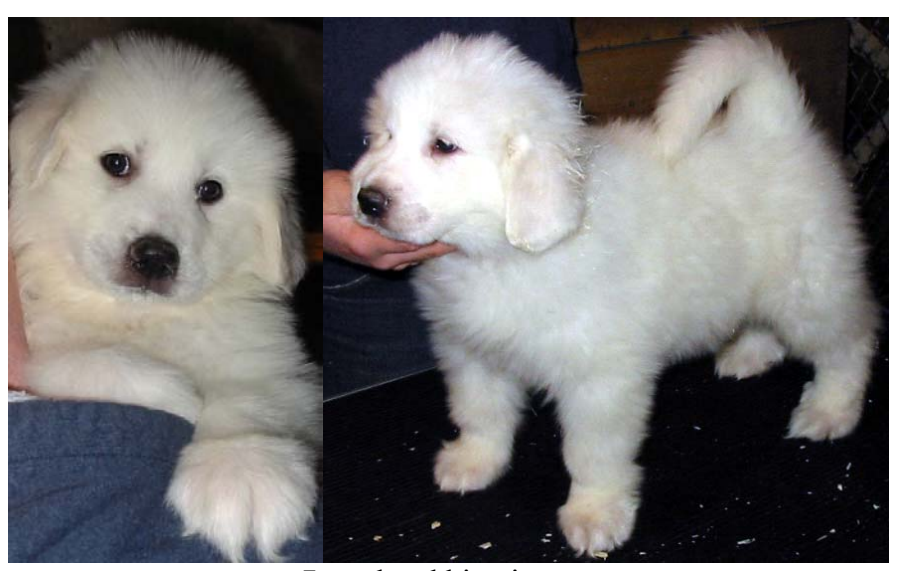
7 weeks old in pictures

Born 12/13/2007- available after 2/11/2008 Ch. Cherlyns Ajax T-Greatest Glory (Ajax) - OFA Excellent x Edgewood's Oh My Darling (Clementine) - Penn Hip