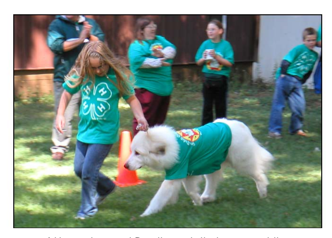
4-H members put Pyrs through their paces at the Fun Match held after the 2007 Regional.