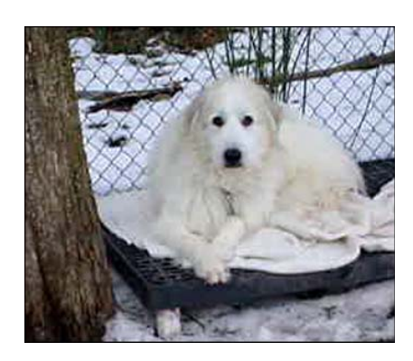
Balibasque Lesarc de Triumph (Chelsea) 9/1/94 - 9/6/07