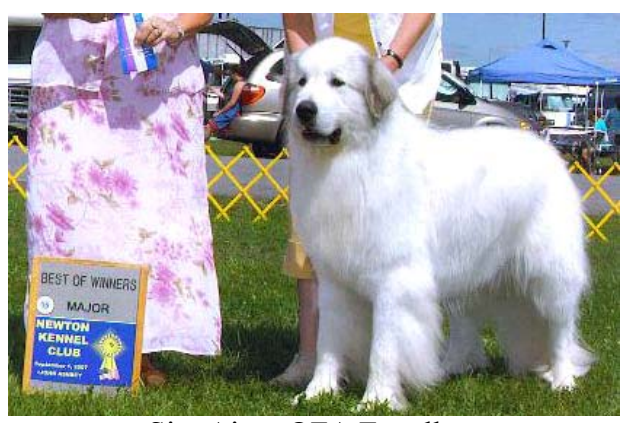
Sire Ajax- OFA Excellent

Home raised, very friendly temperaments, up-to-date on vaccines and wormings Vet checked and approved, references available