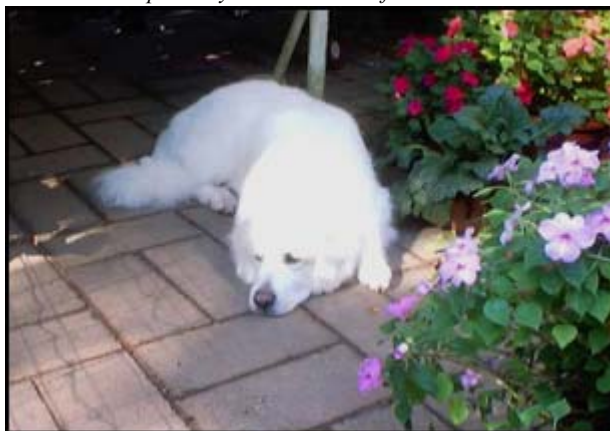
Remmy relaxes on the patio.