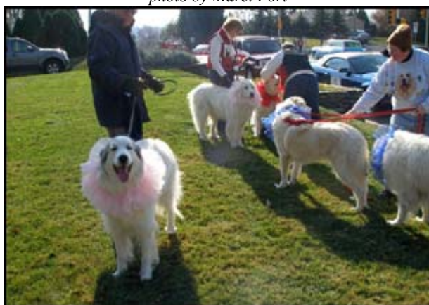
Penn-Dutch Pyrs prepare for Parade.