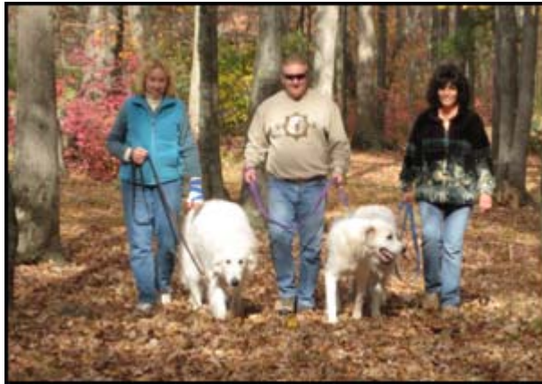
Penn-Dutchies enjoy Pytoberfest.

On October 18th Penn-Dutchies participated in the first annual "Pytoberfest" (formerly the fall Walk-in-the-Woods) at Beltzville State Park. There was lots of food, scenic walks, and time to relax and socialize.